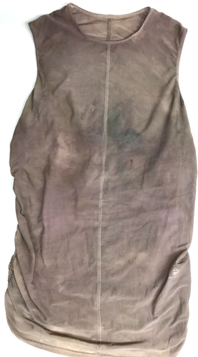
Figures 3a and 3b. (Left) performance documentation photograph; (right) post-performance documentation: the berry-dyed costume is stained and marked by the wearing body and interactions with the microalgae on the floor surface. a life - nomadic melodrama (2017), Kallio Stage Helsinki. Costume design: Ingvill Fossheim.