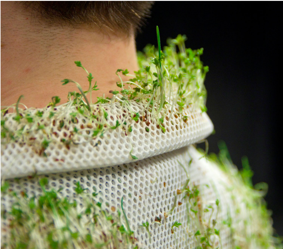
Figure 1. Organorgan (2013), Theatre Academy Helsinki. Costume design: Liisa Pesonen.

microbial cellulose as costume material. The productions are Posthuman (2016); a life – nomadic melodrama (2017); Posthuman days (2018); and A Prologue (2020), two of which are further analysed as case studies in this article. These global design precedents indicate great potential in furthering the environmental agenda of the field.