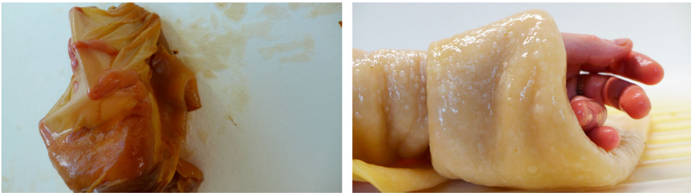
Figures 4a and 4b. Microbial cellulose and the costume designer's hand: (left) work-in-progress, creation of a membrane; (right) a thicker sheet of wet microbial cellulose, testing of weight and movement on the human body. Posthuman days (2018), Zodiak Stage Helsinki. Costume design: Ingvill Fossheim.

correspondence with a non-human living system exploring how this might contribute to the emergence of form and material expressivity as costume on stage.